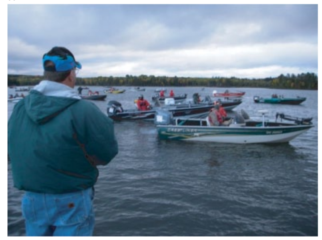
Figure 4.4.1 (a) A child fishes with his father for sunfish Lepomis gibbosus in a small lake in eastern ON, Canada, emphasizing one of the socio-economic benefits of inland recreational fisheries (time with the family). (b) A trophy muskellunge Esox masquinongy captured by a specialized musky angler on a river in eastern ON, Canada, where release rates approach 100%. (c) A black bass Micropterus spp. fishing tournament in northern ON, Canada, where anglers compete for the largest mass for the daily bag limit. Fish are retained in aerated live wells aboard the boat until weighing at a central weigh-in station at the end of the day when fish are released.