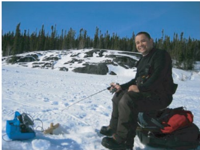
Figure 4.4.3 (a) An angler uses an ice auger to drill a hole through the ice in preparation for ice fishing in ON, Canada (Photograph by Greg Bulte). (b) An angler tends several tip-up rigs used to fish passively in the winter on the St Lawrence River, Canada (Photograph by Greg Bulte). (c) An angler jigs a minnow bait under the ice while fishing for pike Esox lucius in the Northwest Territories of Canada ( Photograph by Karen Murchie).

(4) consider the future of inland recreational fisheries in the context of threats and opportunities; (5) identify information needs for long-term sustainability of inland recreational fishes and fisheries. Our approach is inherently global, although the literature and scientific knowledge are biased towards recreational fisheries in developed regions including North America, Europe and Australia. We attempt to highlight differences and unique challenges associated with recreational fisheries development in developing countries and emerging economies. We include recreational fisheries that target anadromous and catadromous fishes but only discuss the freshwater phase. Recreational fisheries are also popular in nearshore marine waters (Coleman et al., 2004), although are often overshadowed by the commercial sector. We use the words inland and fresh water interchangeably, although technically inland refers to waters upstream of any tidal influence. Where relevant, we draw comparisons between the recreational sector in marine and inland waters.