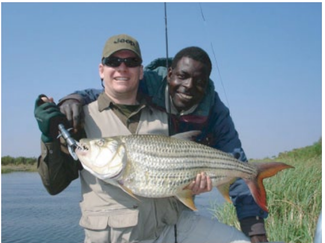
Figure 4.4.2 (a) A female angler captures a native salmonid in a small stream in AB, Canada, with fly fishing gear. (b) A bowfisher takes aim at an invasive koi carp Cyprinus carpio in the Whangamarino wetlands, Waikato, New Zealand. (c) A tourist poses with his guide at a lodge on the Zambezi River in Zambia, Africa, while holding a tigerfish Hydrocynus vittatus caught on rod and reel.

(and recognition) of the recreational sector in inland waters and the fact that the management of recreational fisheries is embedded within a complex suite of non-fishing influences and competing uses, we focus this chapter on recreational fisheries and outline a road map of its characteristics and major management approaches. Our work complements earlier syntheses on the very same topic (Cowx, 2002 b ; Arlinghaus & Cooke, 2009), but in contrast to earlier papers, we will focus exclusively on fresh water.